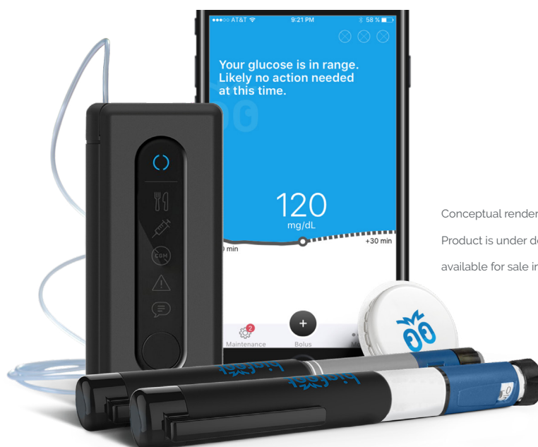
Conceptual rendering of research device. Product is under development and is not available for sale in the United States.

Initially, Bigfoot Biomedical purchased a combination of Requirements Management, ALM, and Reviewer licenses for their respective teams, but quickly found that the all-encompassing functionality of ALM licenses better suit their needs. Since 2016, they have expanded their pool of licenses to a total of over 80 codeBeamer users.